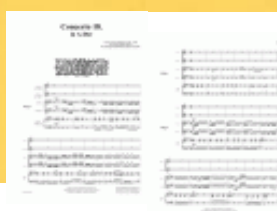
Concerto 18 - Cover page

This longer concerto in A consists of three movements. It is written for 2 trumpets and the church trio.